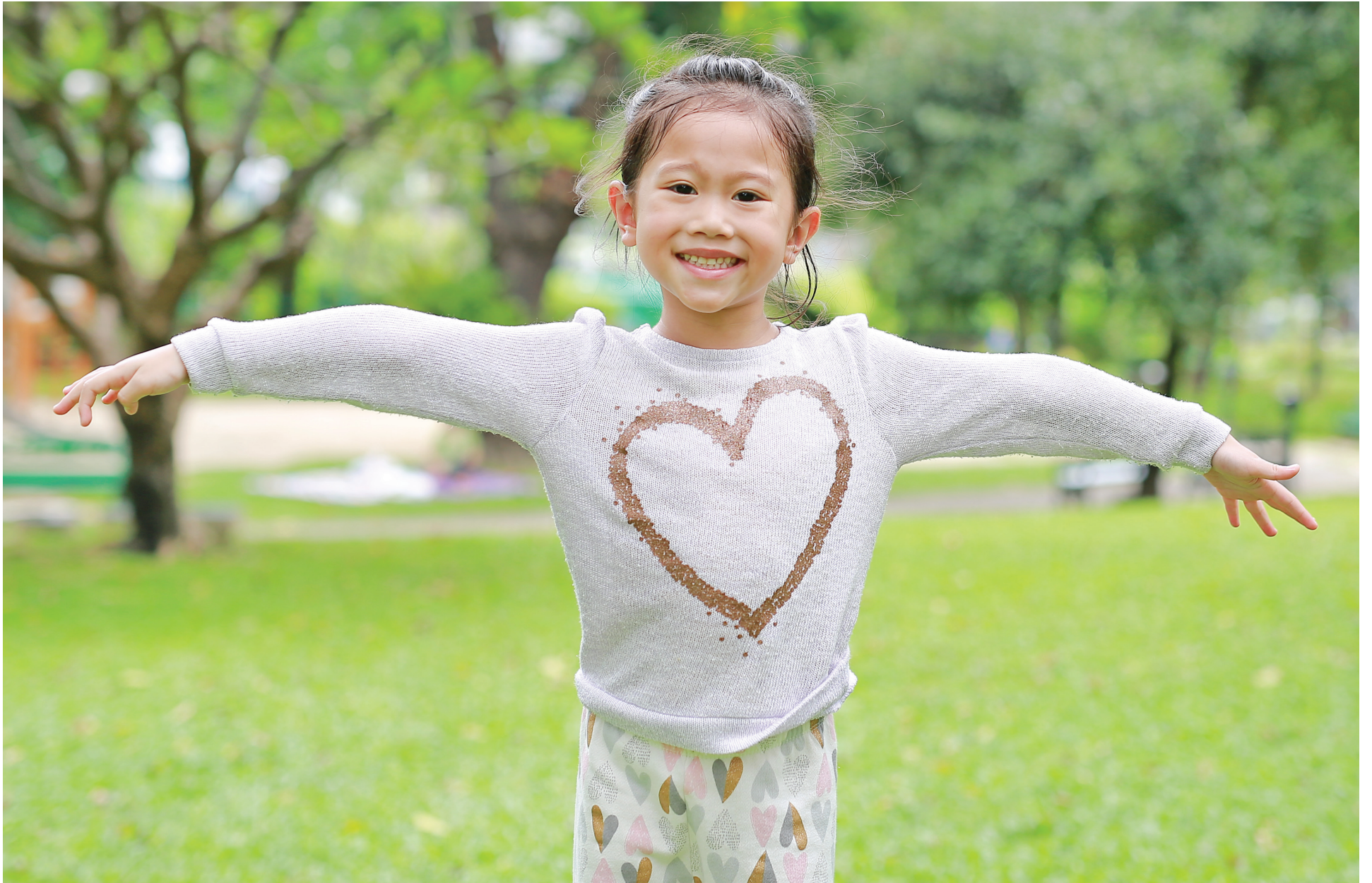
Modelling Action Cards Fatama Fata Celebration