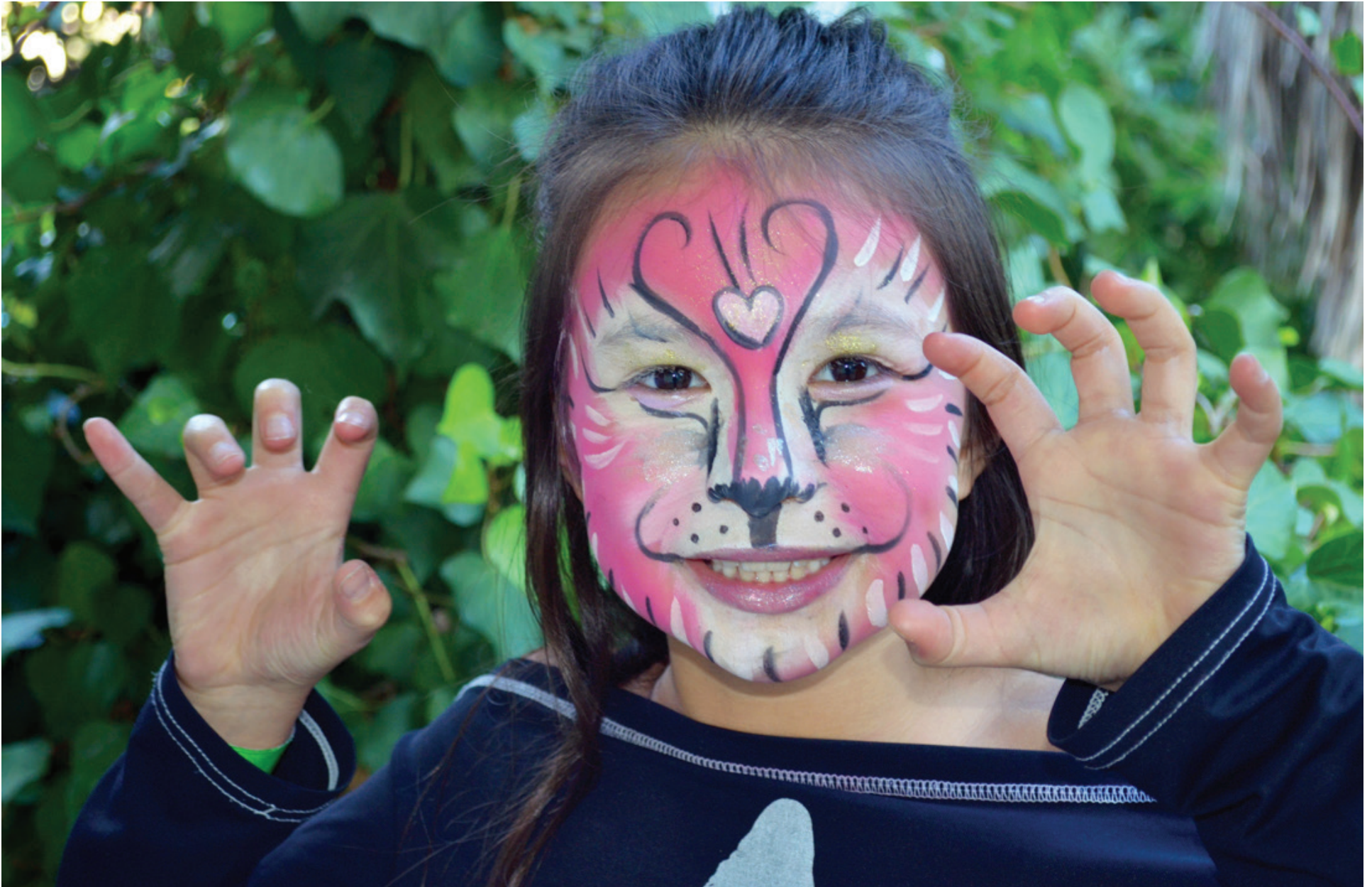
Modelling Action Cards Fatama Fata Celebration